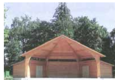
The Mary Park performance shelter will look similar to this. Our shelter will not have the dressing rooms.