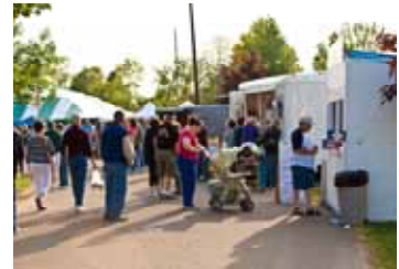
The food vendors were busy too.