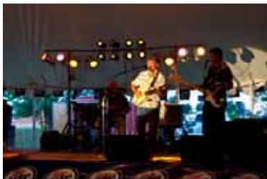
Trigger Happy kicks off Fun Fest on Thursday