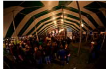
Large festival tent kept everyone dry