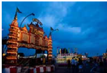
Skies threatened on Friday but the weather was great at Fun Fest