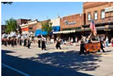
New Richmond High School Band in the Grand Parade