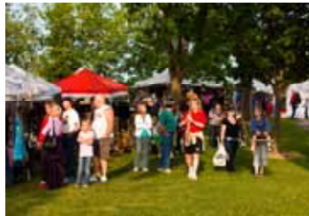
Friday night was a busy night for the vendors!