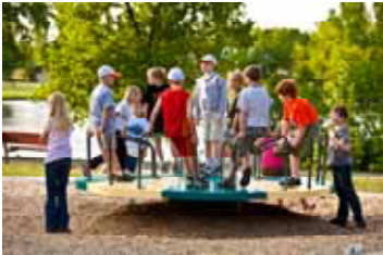
Even the kids got into the action at Mary Park