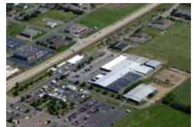
Birds eye view of the Fun Fest grounds