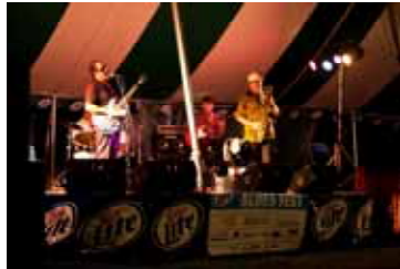
Reverend Raven keeps the main tent hopping!