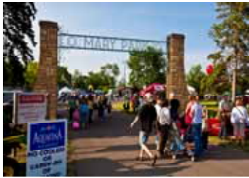
A glorious Friday evening to kick-off Park Art Fair